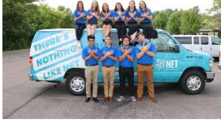
NET Ministries Retreat