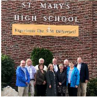
Class of 1969 Reunion