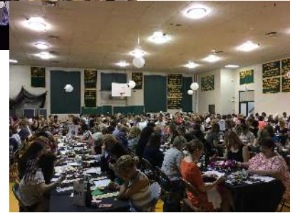
Designer Bag Bingo